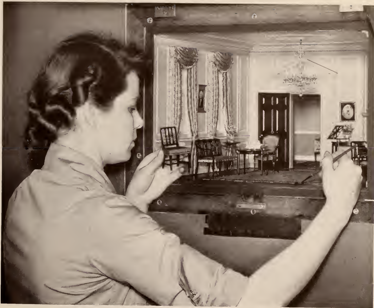
PHOTOGRAPH SHOWING THE RELATIVE SCALE OF THE ROOMS AND ALSO THE METHOD OF CLEANING WITH SMALL BRUSHES